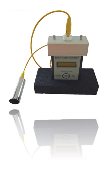
MK 023 -measuring head-

up to \pm 4kV Head to measure DC-Voltage with an Input impedance from 10^{16} Ohm