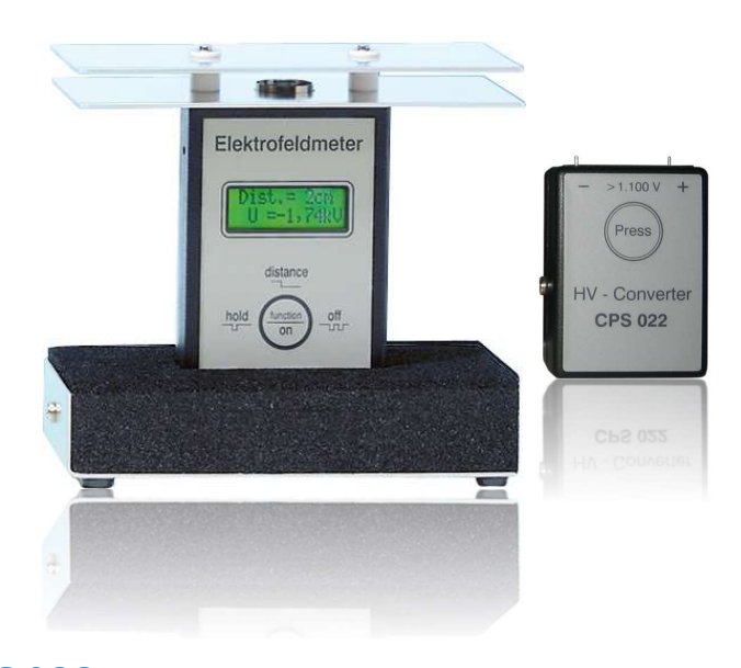
CPS 022 Charge Plate Set

To test air ionization systems by measuring the discharge time